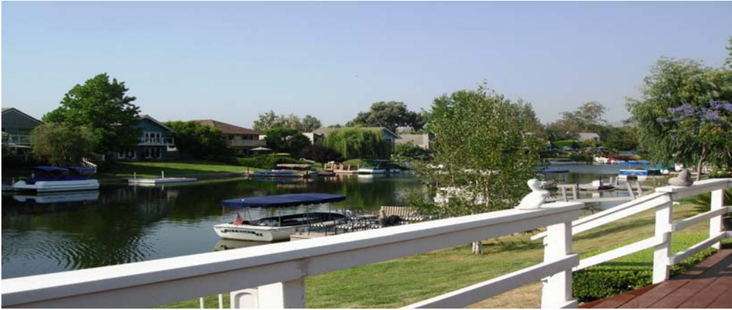
One Story Lakefront Home www.1567LaVenta.com $1,099,000