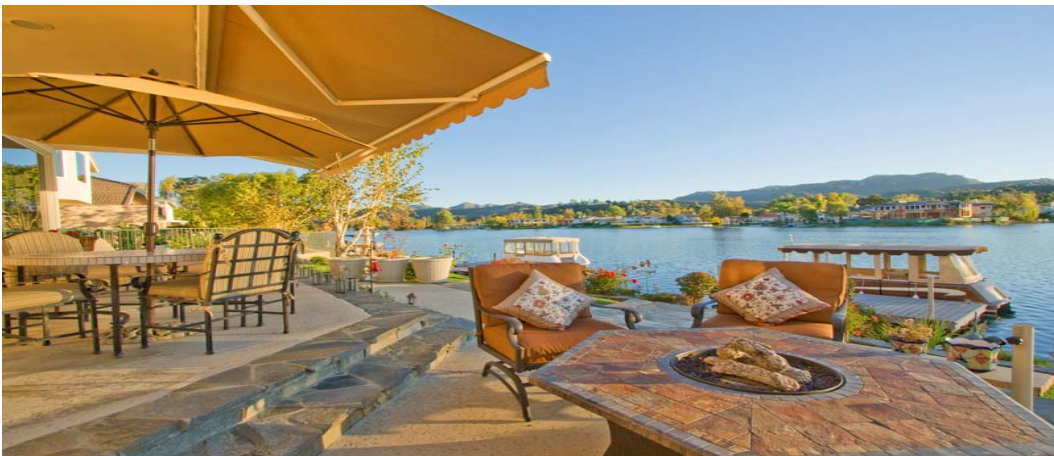
Stunning Custom Built Home www.2516Oakshore.com $2,399,000